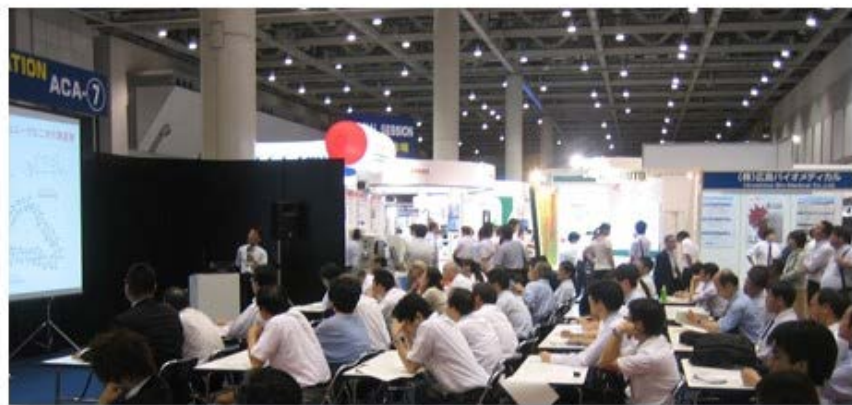
(Audiences in Conference Hall)