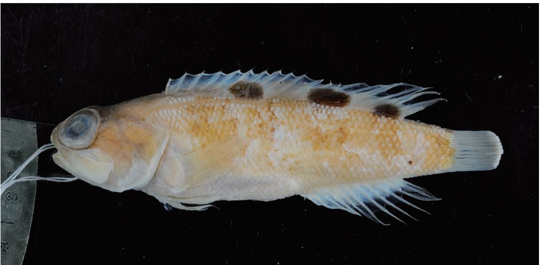
Fig. 2. Opistognathus trimaculatus sp. nov., NSMT-P 111154, holotype (in preservation), 72.0 mm SL, female, off Kochi City, Tosa Bay, Japan.