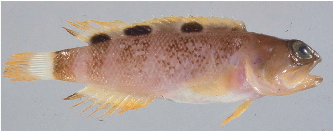
Fig. 1. Opistognathus trimaculatus sp. nov., NSMT-P 111154, holotype (in fresh), 72.0 mm SL, female, off Kochi City, Tosa Bay, Japan.

Paratype. BSKU 37494, 67.8 mm SL, 82.7 mm TL, female, Mimase fish market, Kochi