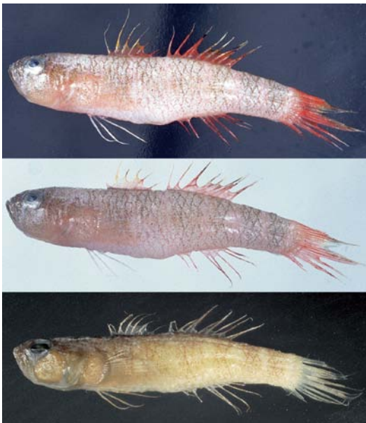
Fig. 1. Fresh (top and middle) and preserved (bottom) conditions of Priolepis winterbottomi sp. nov., holotype, BSKU 64659, female, 31.9 mm SL.

Proportional measurements are given in Table 1. Body slender, slightly compressed. Head rather depressed, its width 108.8–114.6% of height. Snout short. Eye large, located dorsolaterally. Eye diameter greater than snout length. Interorbital space wide, almost equal to pupil diameter. No dermal ridge on mid-line of nape. Mouth terminal, oblique, forming an angle of about 50° with body axis. Lower jaw projecting beyond upper jaw. Posterior end of jaws reaching between vertical lines at anterior rims of eye and